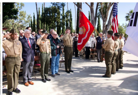
The 5th Marine Memorial Park was the perfect setting for healing for the Gold Star families of the fallen and Marine brothers