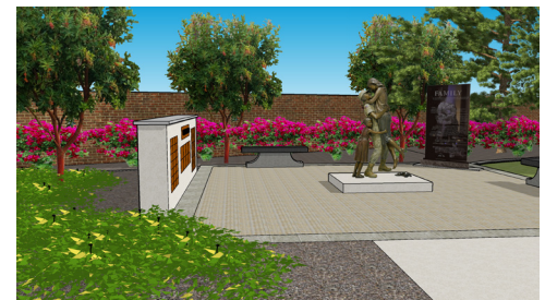
Proposed Layout in Heritage Park

Donations of ANY AMOUNT are gratefully accepted. Please note in the subject line of your check or credit card donation, "Returning Home." Your financial contribution will help to make this vision a reality. This is your opportunity to show your gratitude for all the sacrifices that are made by Marine families. Let us make "Returning Home" a tangible reminder of our thanks.