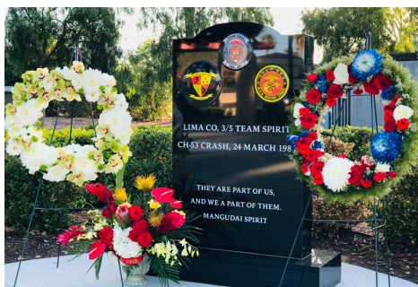
Memorial dedicated to honor the 29 men of the Team Spirit crash in 1984

Lima Company 3/5 (82-85) Monument Committee