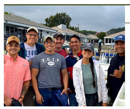
Fishing crew—tall tales were told!