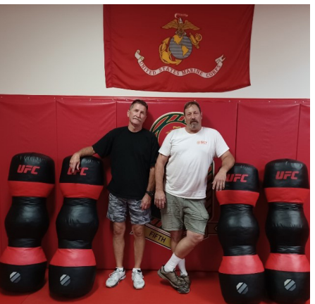
New "Dumbbells" for the Dojo